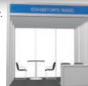
Standard Booth 9 Sq.M