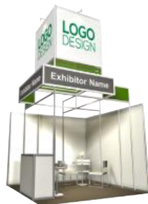
Premium Booth - 9 Sq.M

สำหรับบริษัทในประเทศไทย โปรดติดต่อเทคโนโลยี เพื่อขอรับอัตราคาบบาท