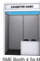
SME Booth 4 Sq.M